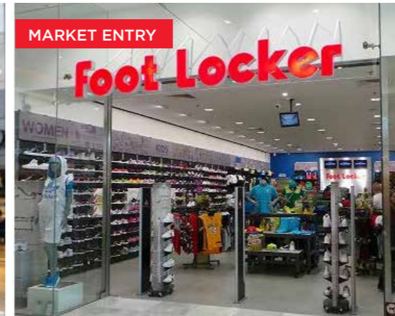
FOOT LOCKER Poland, Czech Republic