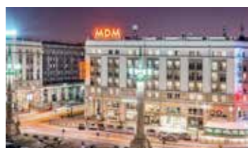
MDM HOTEL WARSAW