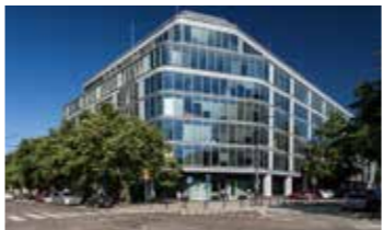
GREEN CORNER A WARSAW