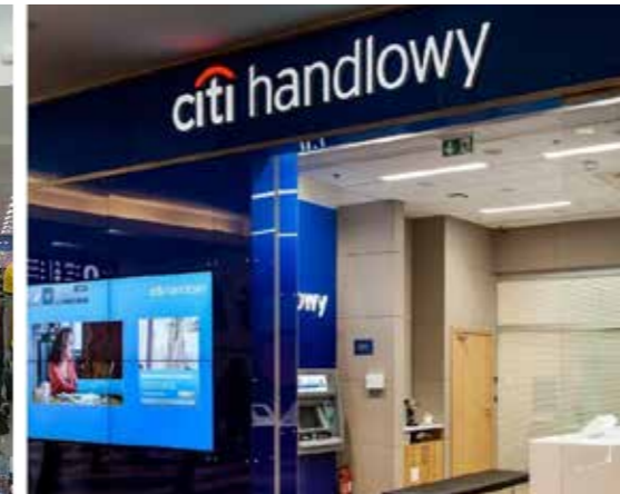
CITI HANDLOWY Poland, Hungary