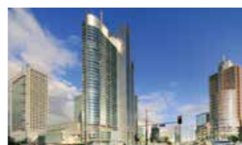
RONDO 1 WARSAW