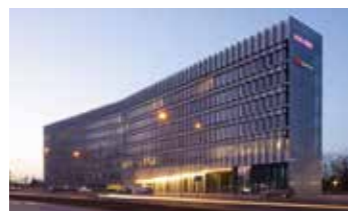
GREENWINGS OFFICES WARSAW