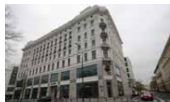
PL. MAŁACHOWSKIEGO 2 WARSAW