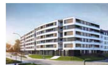
METRO PARK II WARSAW