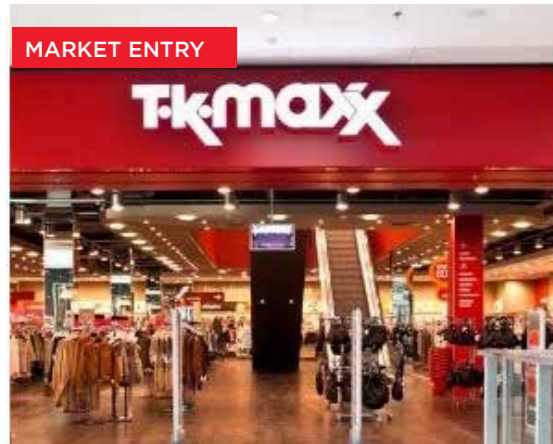
TK MAXX Poland