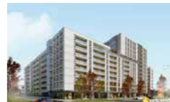
WOLSKA 171 WARSAW