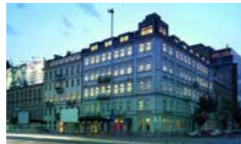
LIPIŃSKI PASSAGE WARSAW