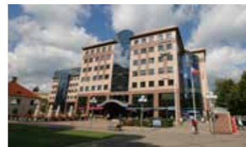
ATRIUM PLAZA WARSAW