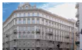
ZŁOTA 83 WARSAW