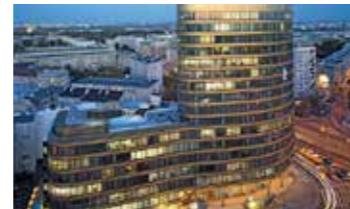
ZEBRA TOWER WARSAW