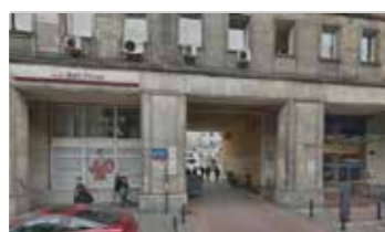
KRUCZA 6/14 WARSAW