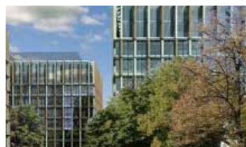
GRÓJECKA OFFICES WARSAW