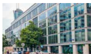
GREEN CORNER B WARSAW