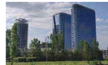
GLOBAL OFFICE PARK KATOWICE