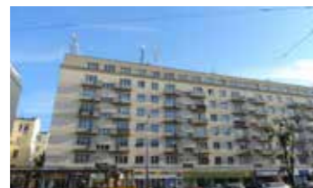
AL. SOLIDARNOŚCI 83/89 WARSAW