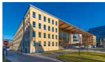
TULIPAN HOUSE WARSAW