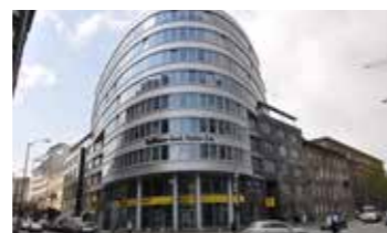
PIĘKNA 20 WARSAW