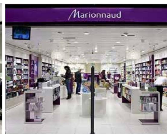
MARIONNAUD Poland, Romania