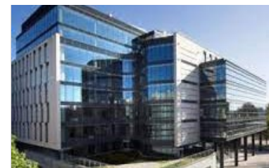
STERLINGA BUSINESS CENTER ŁÓDŹ