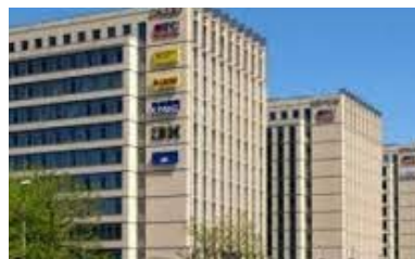
GTC OFFICE COMPLEX GALILEO, NEWTON, EDISON, PASCAL KRAKÓW