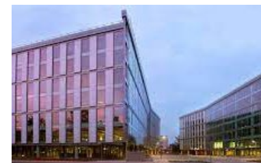
FRANCUSKA OFFICE CENTRE KATOWICE