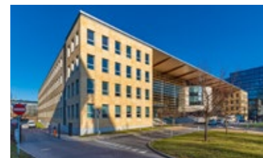
TULIPAN HOUSE WARSAW