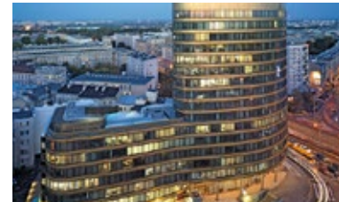
ZEBRA TOWER WARSAW