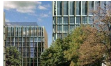
GRÓJECKA 208 WARSAW