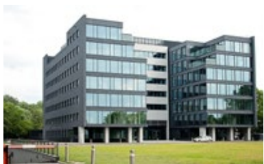
AEROPARK BUSINESS CENTRE NOTHUS, ZEPHIRUS, CORIUS WARSAW