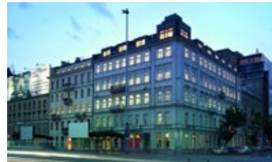
LIPIŃSKI PASSAGE WARSAW